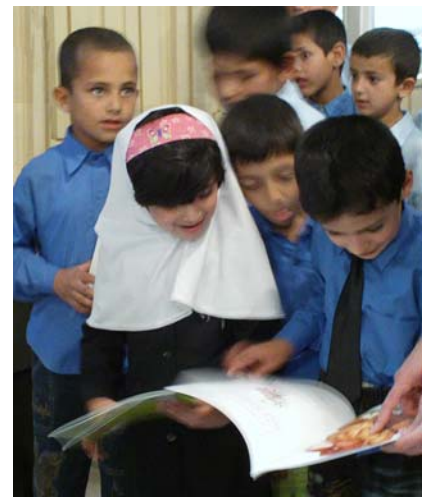
A matching grant and contributions from family and friends enabled these students at Amani High School in Kabul to receive Dari-Pashto books donated by soldiers from Camp Eggers inside Afghanistan.

PLEASE GIVE WHATEVER YOU CAN TO HELP US REPATRIATE THESE STORIES AND PROVIDE CHILDREN WITH THESE MUCH-NEEDED BOOKS