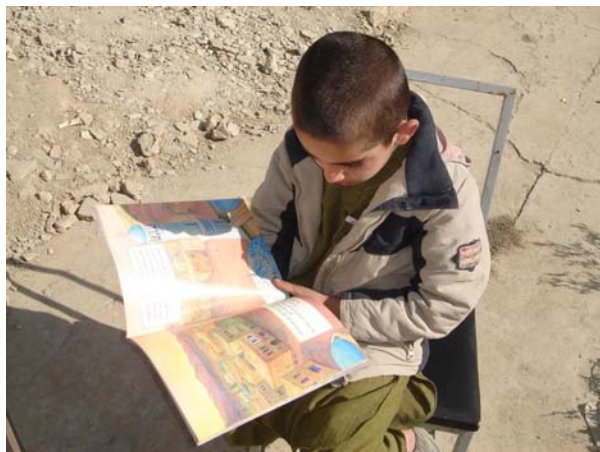
A nine-year-old student in the fourth grade at a school in Kabul reading The Boy Without a Name by Idries Shah in a bilingual Dari-Pashto edition.

See http://www.hoopoekids.com/afghanistan.htm and http://www.hoopoekids.com/pakistan.htm for updates on these efforts as they become available and to print out copies of an information flyer for your own fundraising efforts.